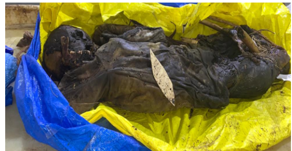
Figure 5: Mummified partially skeletonized dismembered body.

Larval of hide beetle ( Dermestes maculatus ) of sizes 0.5cm to 0.75cm and pupae few adult forms are present over the body (Figure 10). Left foot and right hand are absent. Lower 1/3 rd of left tibia is having a irregular but precisely cut margin (Figure 11). The ends of right fore-arm lower 1/3 rd is irregular (Figure 12). The 3 rd molar tooth has been sent for DNA analysis.