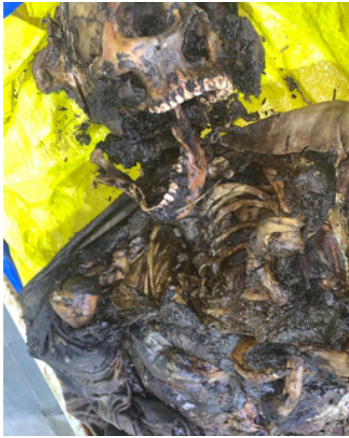
Figure 7: Skin over the face and neck and other soft tissues are disintegrated exposing ribs and vertebrae.