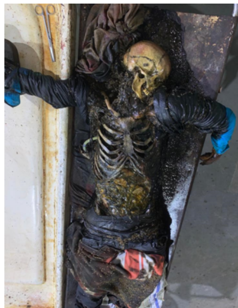
Figure 1: Body skeletonized with disintegration of scalp and skin over trunk with exposed skull and ribcage.