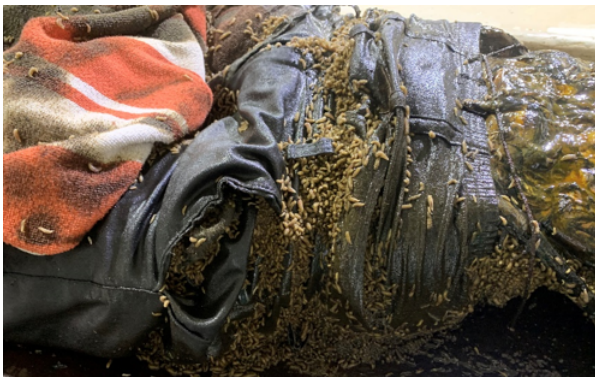
Figure 4: Masses of maggots crawling over the body.