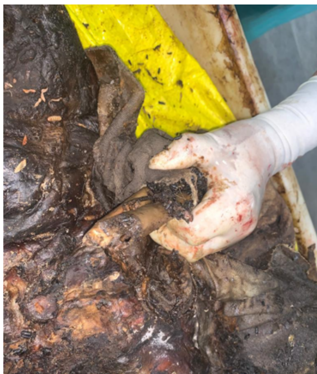
Figure 12: Irregular margins of lower 1/3rd of right forearm with absent right hand.

separation of mandible from the skull made it difficult to make out the features.