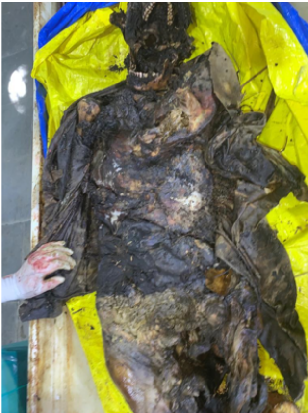
Figure 8: Dry, Leathery, shrivelled mummified tissue over the abdomen covered by thick jacket.