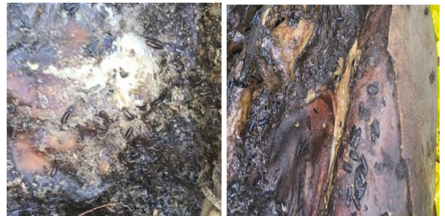
Figure 10: Larval and pupal forms of dermestes maculatus .