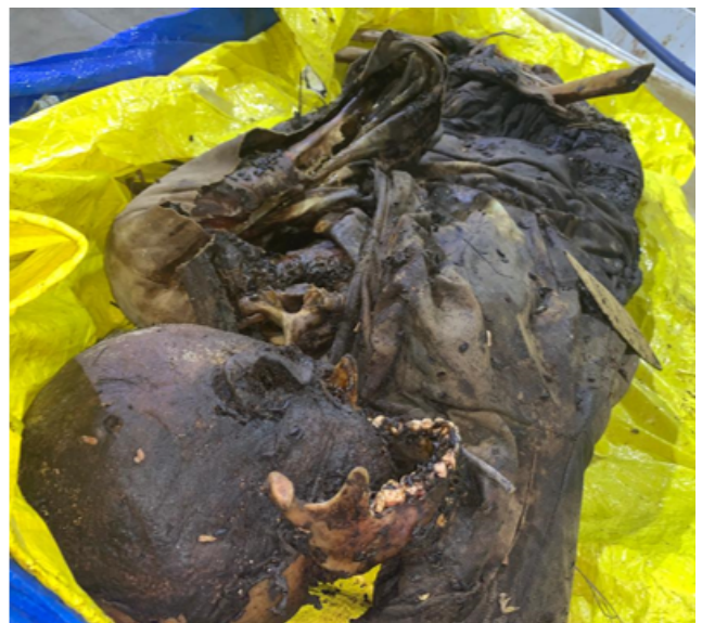
Figure 6: Scalp hair is lost and scalp became thick leathery. Mandible is separated due to disintegration of soft tissue.