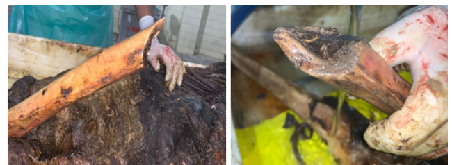
Figure 11: Irregular cut margins over lower 1/3rd of left tibia with absent left foot.