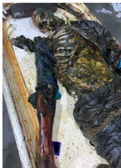
Figure 2: Softened blackish internal organs in the process of disintegration.