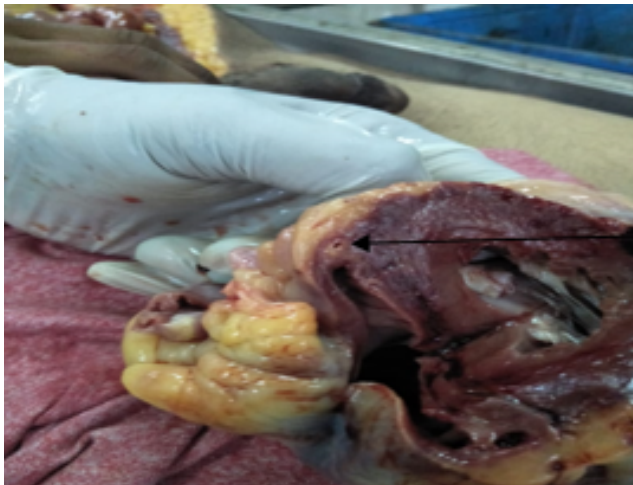
Fig. 1: Arrow point shows patent lumen with MB in LADA

Stomach and piece of small intestine with contents, pieces of liver, spleen and both kidneys and small amount of blood preserved for chemical analysis were negative for toxins or abnormal chemicals.