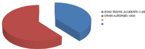
Fig. 1: Indicates the total number of autopsies conducted during the period of study