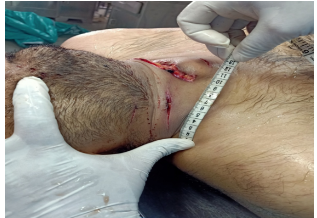
Fig. 2: Picture showing multiple nearly horizontal and parallel self-inflicted superficial & deep incised wounds of the neck.

Another Set of injuries were Four, Nearly Horizontal Deep incised Wounds situated above the Thyroid Cartilage over the Right side Neck as seen in Figure 2. Each Deep Incised wounds were associated 3-4 superficial incised wounds each on average measured 5cmsx0.2cms and their depths were limited to the Muscular Layer Except one in the front which severed the Anterior Jugular Vein. The Carotids and Internal Jugular Vessels and Respiratory Passage were Intact. Another pattern of injuries were Blunt Lacerated