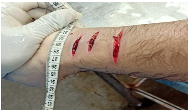
Fig. 1: Picture showing multiple linear and parallel self-inflicted deep incised wounds of the ventral aspect of left forearm.

A 32years male jumped to death from his 5 th floor apartment. The Investigating officer confirmed that there as pool of blood in his apartment and the doors were broken open to gain access to his apartment. He committed this act in the absence of his family members, earlier unsuccessful attempts in the form of Insecticide Consumption and Failed Suspension by Neck were also Present. A two-page Suicide note was also recovered from his room. He was brought dead to the Hospital, he had died on the spot. An enquiry with his friends and family members revealed his unusual behavior in the recent months, lack of interest in his family friends and sleeplessness. He had frequent fights in his work place and known Financial worries At the autopsy, external examination showed Three different patterns and Nature of Injuries distributed over the Left side, of which One group were Fatal in Nature. One Pattern was noticed over his Left Forearm proximal to the Wrist consisting of Three Deep Incised wound, parallel to each other as seen in Figure 1, each tapering to the medial margins were uniform in length and depth as limited to the Muscular layer.