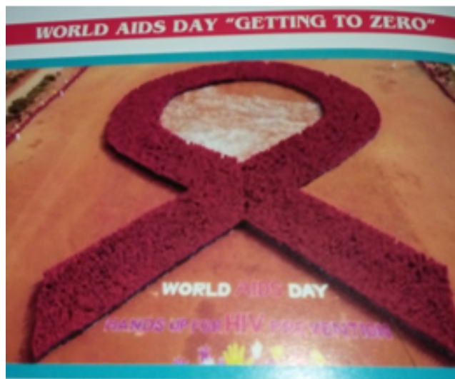
Fig. 1: (Largest Human Chain)

staying away from home, falling sick and fear of stigma, etc. In a study of Ethiopia, it was observed that social support is positive predictor where as depression and substance abuses are negative predictions of drug adherence. In India in seven cross sectional and one retrospective study enrolling 1660 participants it is seen that ART adherence rate is around 70%.