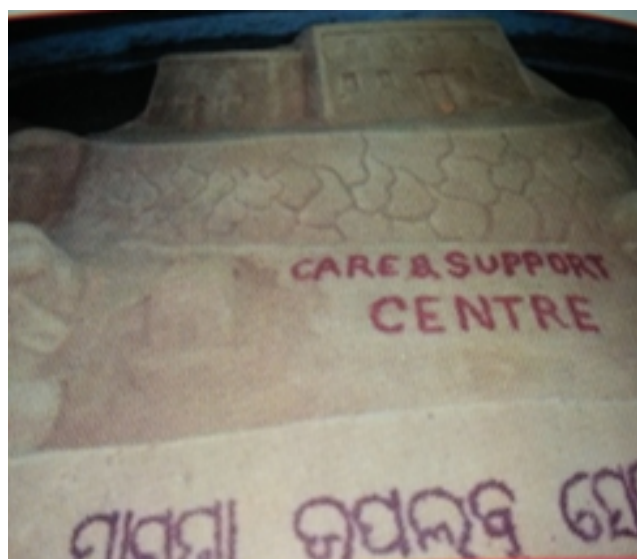
Fig. 2: (SAND ART in Odia language)