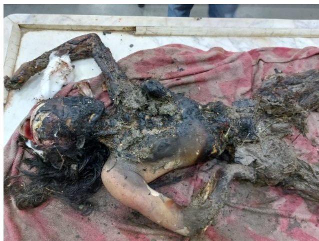
Fig. 1: Superficial to deep burns