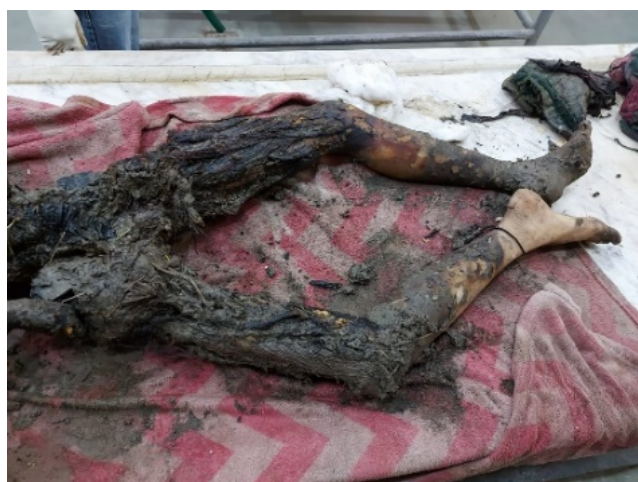
Fig. 2: Partially burnt clothes seen by the side