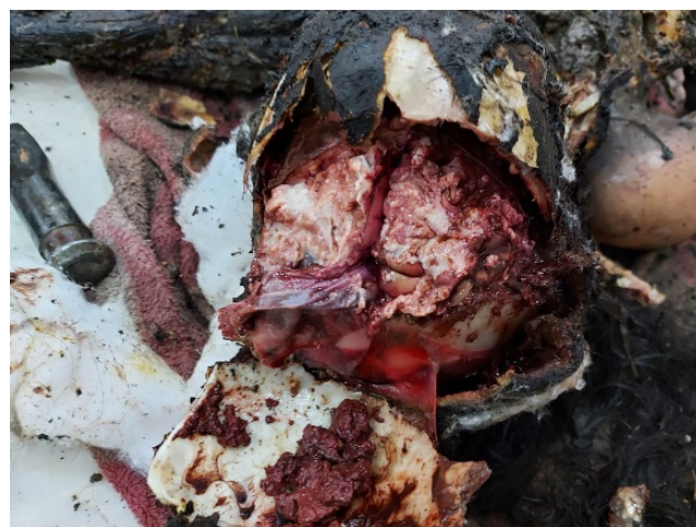
Fig. 4: Torn dura with Extra-dural hemorrhage