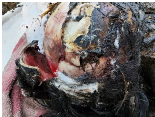
Fig. 3: Depressed fracture of skull

inside. Superficial and deep burns were seen almost all over the body except in a few places on the right shoulder and right leg. Peeling of epidermis along with blackish discoloration seen all over the body due to burns. The scalp and other body hairs showed singeing effects due to burns. Muscles and bone-deep burns were seen on the head & face, chest, abdomen, and pelvic region up to the lower portion of both knees. There was no soot particle deposition in the trachea. Ribs and sternum also charred deep to underlying lungs and heart. The abdominal cavity showed deep burns involving portions of the stomach and intestine. Pelvic organs too showed burn effects. The uterus is empty, normal in shape and size but congested.