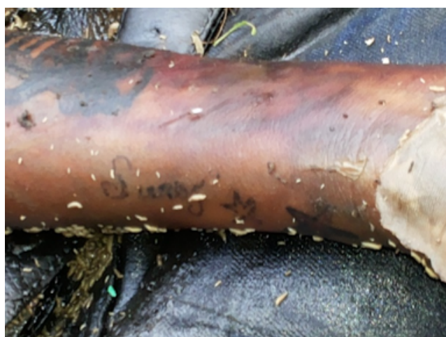
Figure 6: Close-up photograph

Through the clothes it was seemed that the person was male but when the hands of the deceased were closely examined (Figure 4 ), it showed that the tattoo was a name written as “Suraj” and there were marks on the hands which indicated that the deceased was a drug addict possibly a smack user (Figure 6).