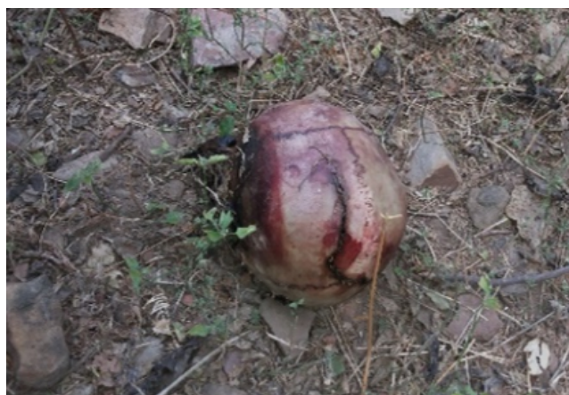
Figure 5: Close-up photograph of skull