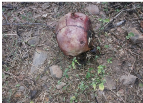
Figure 2: Skull

On early investigation, it seemed that the body was eaten by animals and clothes suggested that the deceased was a male. Skull and mandible were found near the dead body (Figure 2). There were animal bite marks all over the body (Figure 3). A tattoo was present on the hand of the deceased (Figure 4). The police officers were investigating the particular cases but to establish the identity of deceased is important before solving the case.