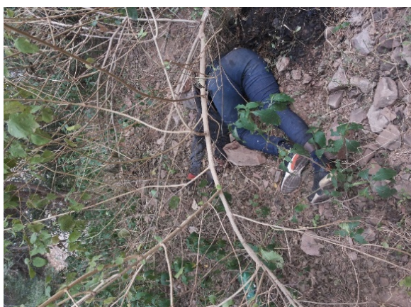
Figure 1: Dead body