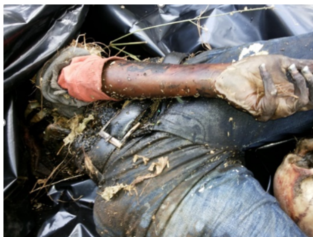
Figure 4: Tattoo photograph