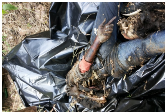
Figure 3: Close-up photograph