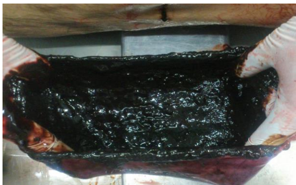
Fig. 2: inner mucosal surface of stomach showing corrosive effects of phenol