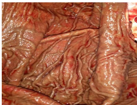
Fig. 2 Stomach mucosa thickening with brownish discoloration