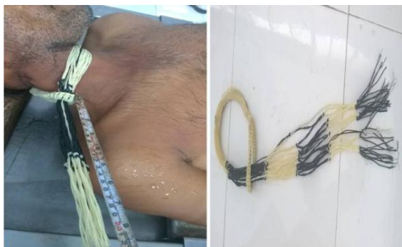
Fig. 2: Ligature material at situ and has been removed and correlated with ligature mark