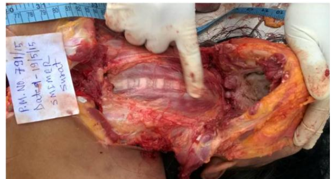
Fig. 4: Looking for any crepitation and abnormal mobility of spine.